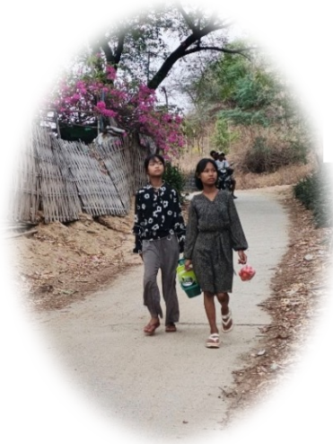
On the way back from work with her cousin.