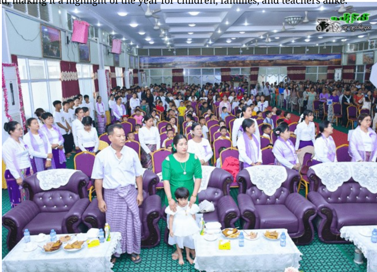
Town Hall where the Christmas Celebration took place 💜

Despite the complexity, the 3 ½ hour event was a great success, and everyone stayed until the end, making it a highlight of the year for children, families, and teachers alike.