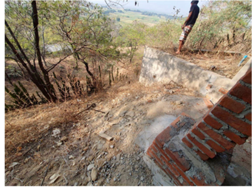
and the retaining walls of the new suites, before the intervention