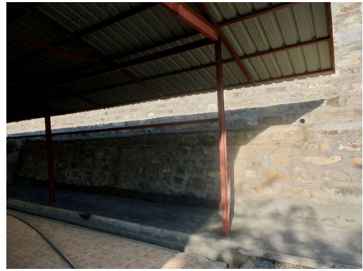
before (page 7) and after by the lower pool