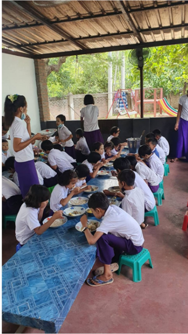
enjoying Mohinga, an absolute Myanmar favourite