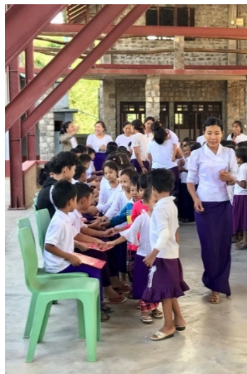
The children congratulate the celebrated