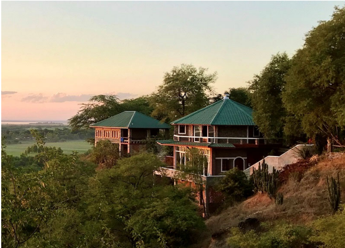
New house with two suites as seen from the south end of the Guest House grounds