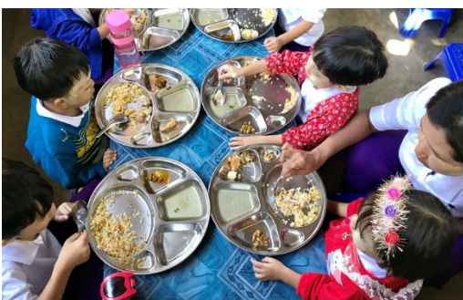
Biryani was the menu of choice this month

Birthday celebrations are always a highlight of the month for the children. Here a few impressions of the November Celebration: