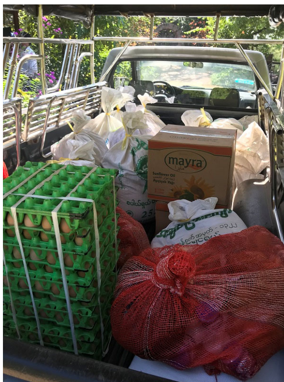
The pick-up, loaded and ready to go for a first run...