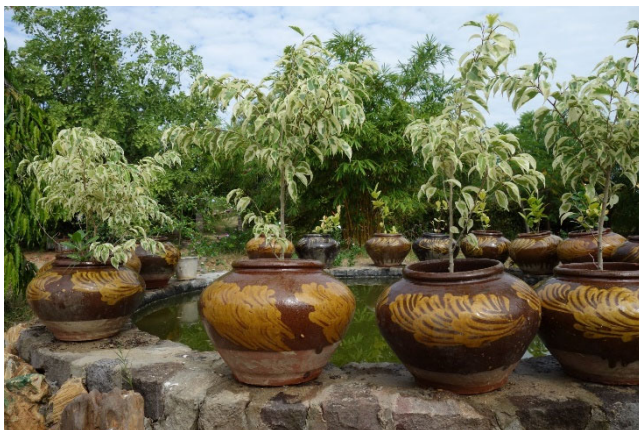
Plants growing in Eric's » nursery «....