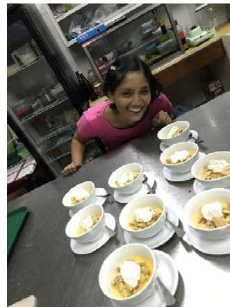
MaThu, pleased with the desert of the day!