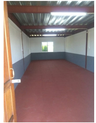
New building seen from the dispensary, terrace around the class rooms, a new room, ready for use!