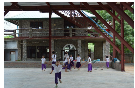
One building, many uses: August birthdays celebration, morning assembly & recreation/sports